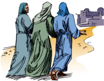
THE ROAD TO EMMAUS REVEALED